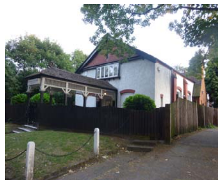
Exterior shots before upgrades started to take place.