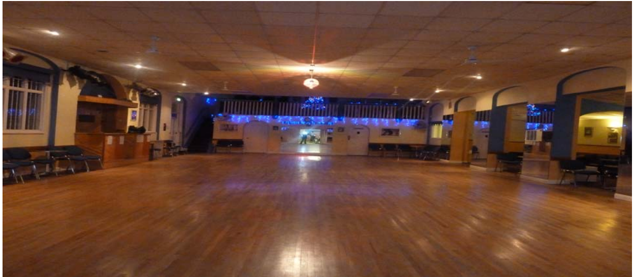
Hall with Christmas lights 2010

Christmas 2010/2011 was the next opportunity for us to forge ahead with our master plan; the rear studio was firmly in our sites. Having had Christmas Day off we began the project on Boxing Day in the knowledge that we had until Jan 8 to complete it before things in the studios really got going again. However, even with best laid plans we still cut it so fine that, (not for the first time) as we were clearing up and taking things out of the rear entrance people were paying to come in at the front door.