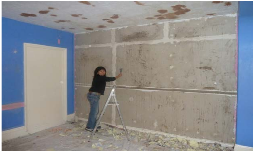
And after much of this.....