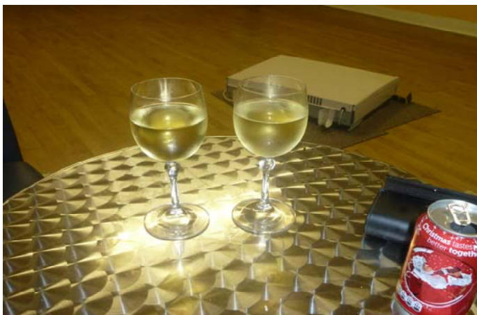
and a little of this once in a while - well it was Christmas after all .....