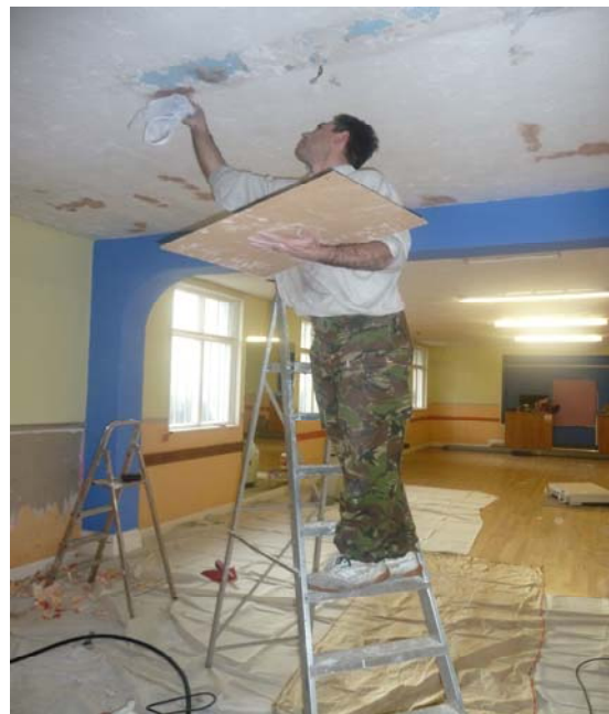
.....and some of this.....